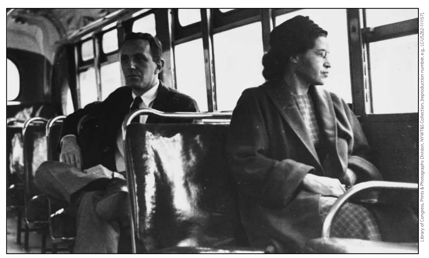
Rosa Parks rides a Montgomery, Alabama, bus (Dec. 21, 1956).

credibility of the images and sources they utilize, their intended audience, and the overall message their photoblog conveys.<sup>8</sup> In this manner, teachers can utilize photoblogs to engage students in historical inquiry while building their media literacy skills. The following outlined lessons use photoblog analysis and creation to integrate core principles of the IDM and media literacy.