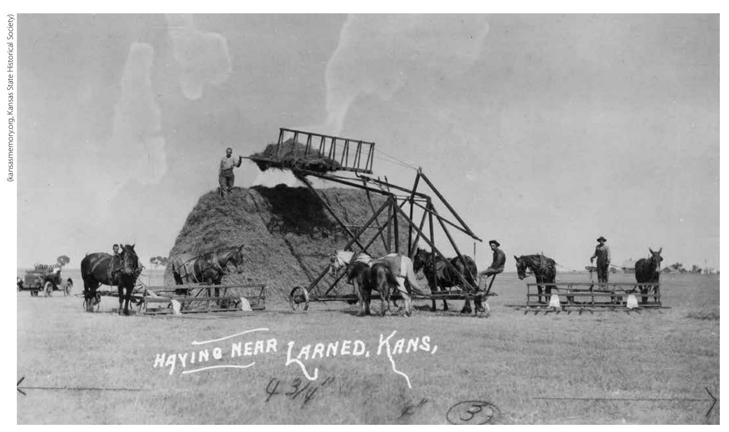
A postcard showing farmers harvesting hay near Larned, Kansas. Between 1880 and 1900.