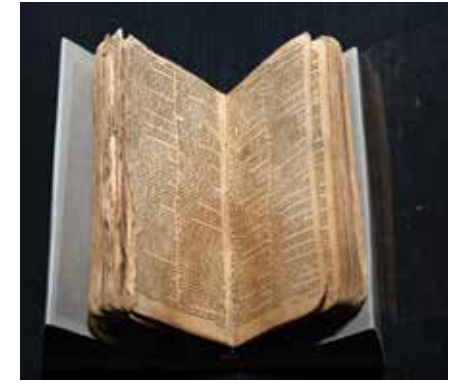
Nat Turner's Bible, 1830s. Bible owned by Nat Turner, who led a historic slave rebellion in 1831. Gift of Maurice A. Person and Noah and Brooke Porter

The museum's education department is committed to inspiring and transforming learners of all ages. The education department is responsible for programming and events that enliven the stories