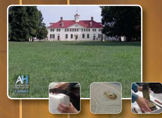
Mount Vernon, Conservation Lab

Tune in to American History TV each weekend for programs including Oral Histories. Civil War. Lectures in History, and The Presidency.