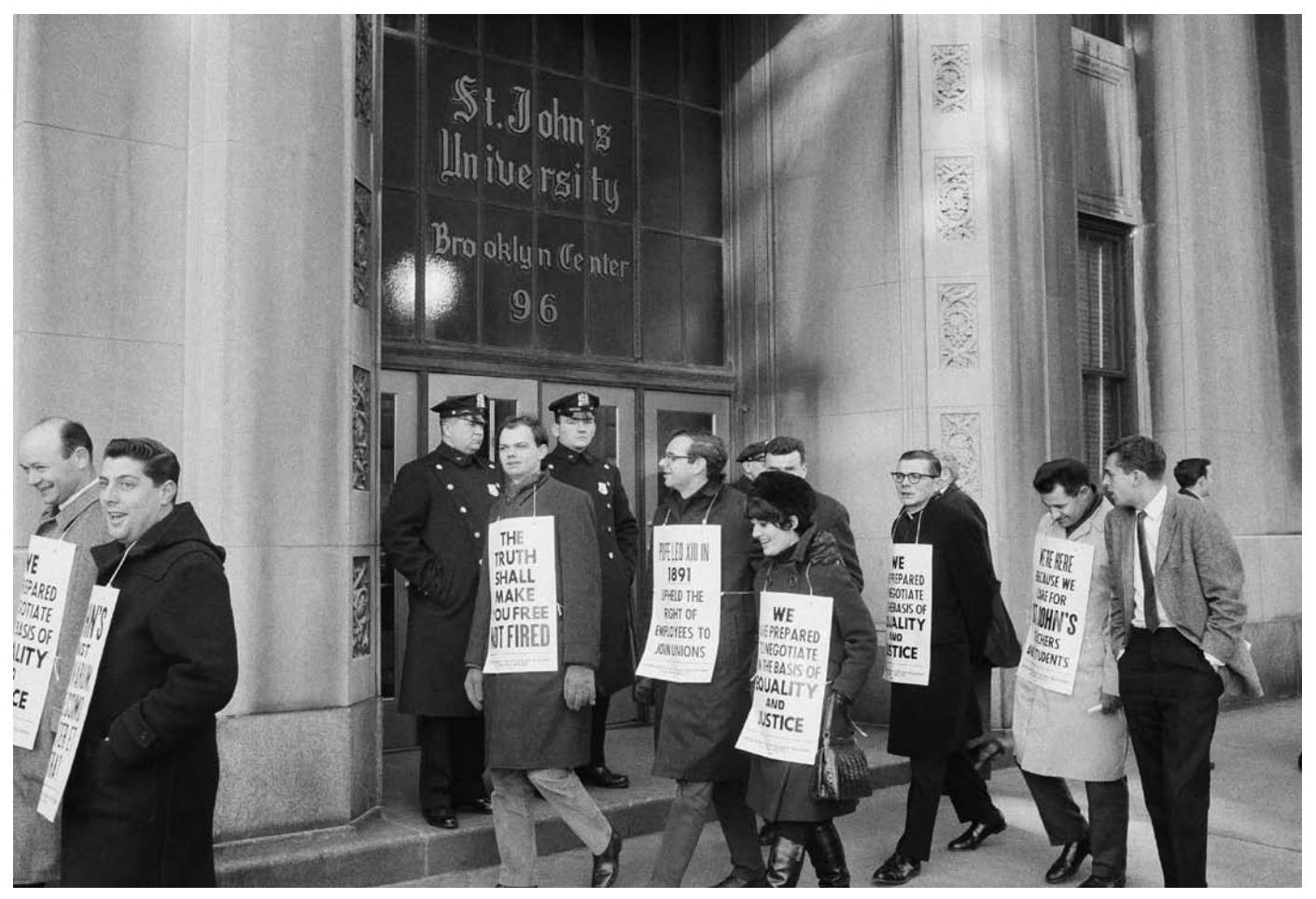
St. John's University's Brooklyn Center is picketed after 31 faculty members were dismissed in New York on Jan. 4, 1966. Strikers claimed the firings were in retaliation for teachers' demands for academic freedom.

Over the past decade, the ALA recorded about 6,500 direct and formal challenges to books, magazines, speakers, topics, and classroom activities of teachers and librarians.<sup>9</sup> Approximately 75 percent of these were school-related.<sup>10</sup> Of all challenges, some 1500 were for sexually explicit material, 1,000 for offensive language, 1,000 for unsuitability in school, 750 for having an occult theme or Satanism, 500 for promoting homosexuality, 300 for nudity, 250 for racism, 200 for sex education content, and almost 200 for being anti-family. The list of authors and books most subject to censorship recently includes: Mark Twain, Maya Angelou, John Steinbeck, J.D. Salinger, Judy Blume, Maurice Sendak, Toni Morrison, Aldous Huxley, Kurt Vonnegut, the Harry Potter series, Diary of Anne Frank, Catch-22, Great Gatsby, Little Black Sambo, The Sun Also Rises.