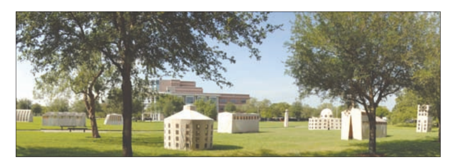
The Transportable City, pictured above, formed part of an exhibit on the grounds of the University of South Florida during April-July 2005. It is a collection of 10 canvas and pipe tents, which constitutes the minimum core needed to construct an emergency city in response to disaster. The designs are inspired by real, iconic structures in Cuba; the city speaks to the condition of exile and feelings of nostalgia experienced by Cubans in the diaspora.

Cuba began to seek independence from Spain in the 1850s in a series of wars that culminated in Cuban independence in 1898. Spain had severely restricted