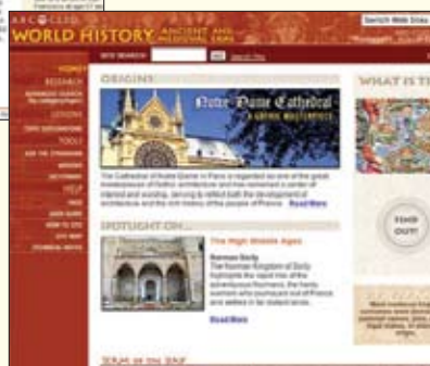
World History: Ancient and Medieval Eras

"[Our students] are used to being able to reach out and view one topic from 20 different angles as opposed to the one angle that a textbook would present. [ABC-CLIO has] digitized all their resource material into a very, very easy-to-use, extraordinarily comprehensive series of websites. [They have a] powerful search function that allows me to direct [my students] to specific documents or essays on specific topics, pictures, maps, audio, video—you name it."