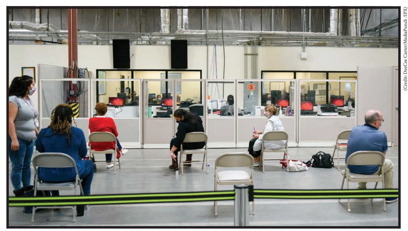
Poll watchers observe poll counts at Clark County Election Center in Las Vegas, Nevada, on November 5, 2020.

nineteenth and early twentieth centuries, political machines, such as New York City's Tammany Hall, helped voters cast ballots multiple times by registering them with fake names, and ballot box stuffing was commonplace. These practices faded by the mid-twentieth century as new laws banned vote-buying and required that ballots be secret. Despite this progress, until the 1960s, most African Americans remained disenfranchised in the Jim Crow South, where states enforced laws such as poll taxes, grandfather clauses, and confusing "literacy" tests to suppress the Black vote.