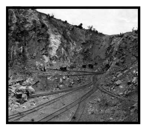
Republic Mine, Empire Zinc Mine, Hanover-Fierro Mining District, Grant County, New Mexico, 1905.

kitchens."<sup>10</sup> The film is an excellent reminder that while the grandeur of films and history may be compelling, there are stories, and important ones too, that live close to us and on a different scale. Salt of the Earth can bring this to your classroom and the Recovery Project can inspire you and your students to find local history to explore and recover as well.