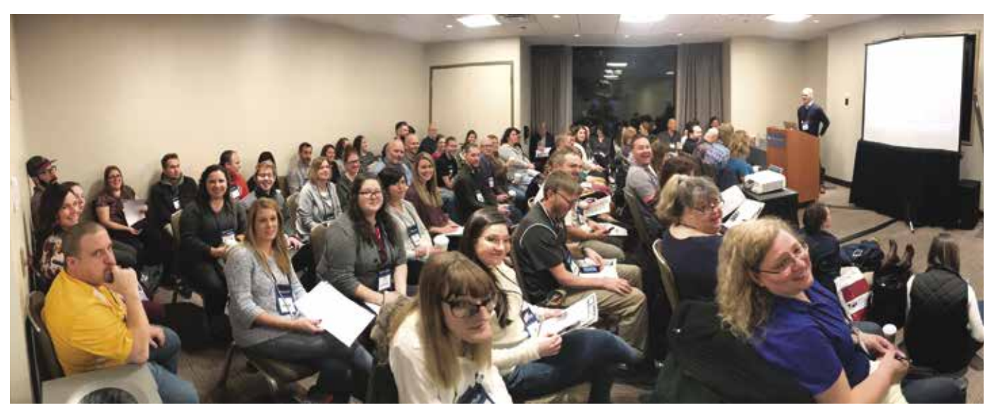
A packed session of the Psychology Community at an annual conference.

We are active year-around within NCSS, creating learning experiences for educators across the country both in online