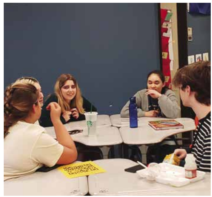
Kingwood High School Rho Kappa small group seminar table discussion.

Chapter Events at Kingwood HS for the 2018–2019 school year included a Les Miserables Movie Night, Dunkirk Movie Night, a Communism Seminar, Tet Offensive Seminar, World War I Seminar, City of Houston Service Opportunity where students wrote letters thanking veterans, a Border Security Seminar, Merits of NATO Seminar, Senior Cord Ceremony and Induction Ceremony. During 2019–2020, students conducted a Global Warming Seminar and organized donations of cards and jeans, a Middle East Seminar. and a Holiday Culture Social.