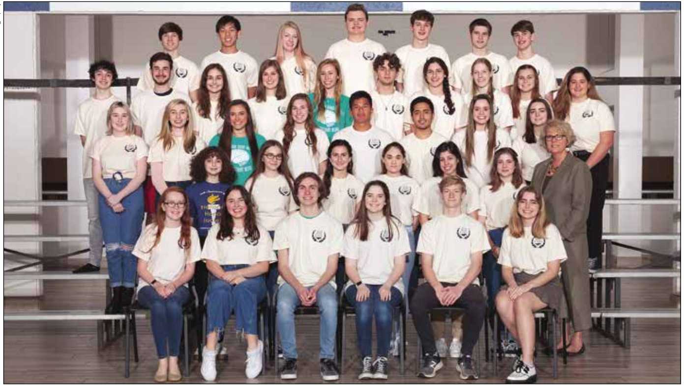
The 2019–2020 Kingwood High School Rho Kappa yearbook photo.