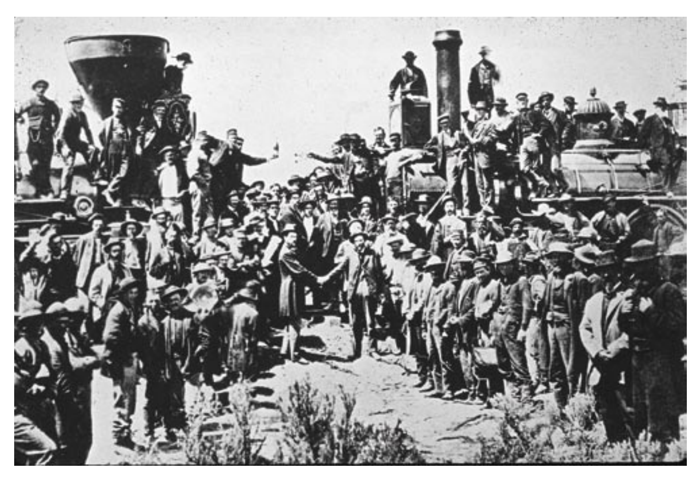
Builders of the railroads in the 1800s.

laborers. They had just been dug out, and lay on the ground. Around them were a few men and fifteen or twenty Irish women, wives, kinfolk, or friends. The women were