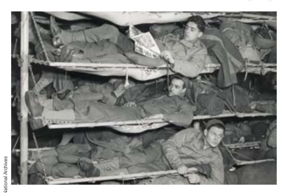
Sleeping quarters on a troop ship, 1944.

The critical purpose of the exercise is to establish a relationship between a large political, economic, or cultural event and the consequences that it had for real people. Students might then be ready to take