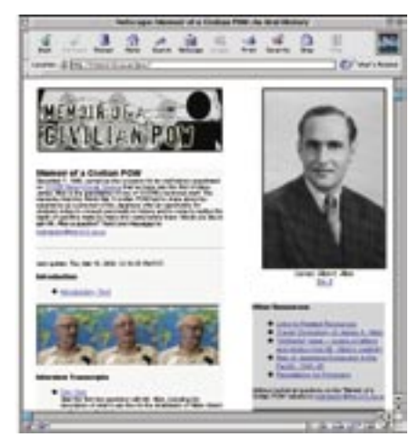
The oral history home page on the SCORE website.

After some getting acquainted and joking around, I asked the questions that we had given to him in advance one at a time. He just talked to me as if I was a friend who knew nothing of the time about which he was speaking. I asked him to clarify a point if I thought that the online audience might not have the knowledge or background to understand something he said.