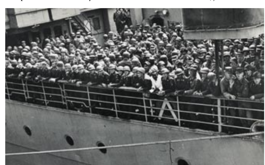
Soldiers returning to Brooklyn, 1945