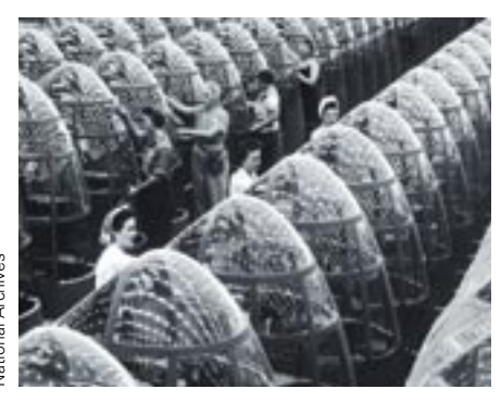
Producing A-20 bomber nose cones, Long Beach, CA, 1942