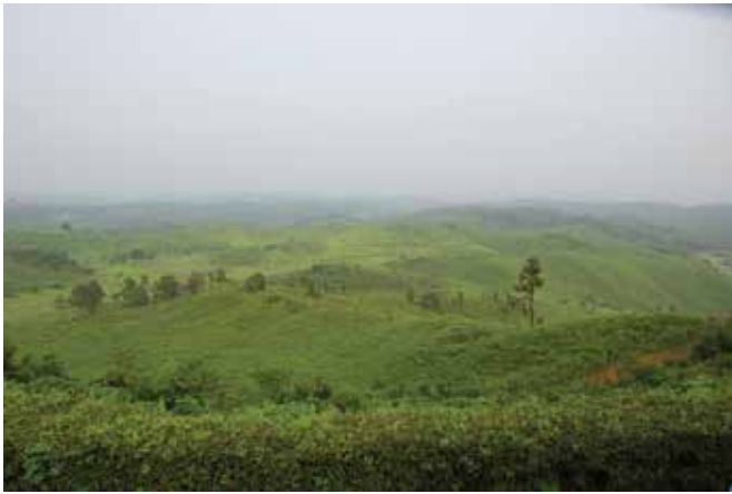
A view of the wild spaces of the DMZ in Korea, 2007