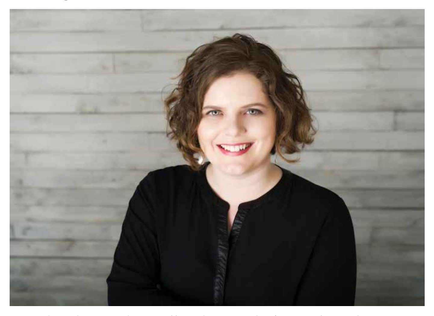
This speech was given as the opening address at the NCSS Virtual Conference on Friday, December 4, 2020.

Before I begin my opening remarks, I want to take a moment to first thank all of those who have been involved in making this year's conference a success: