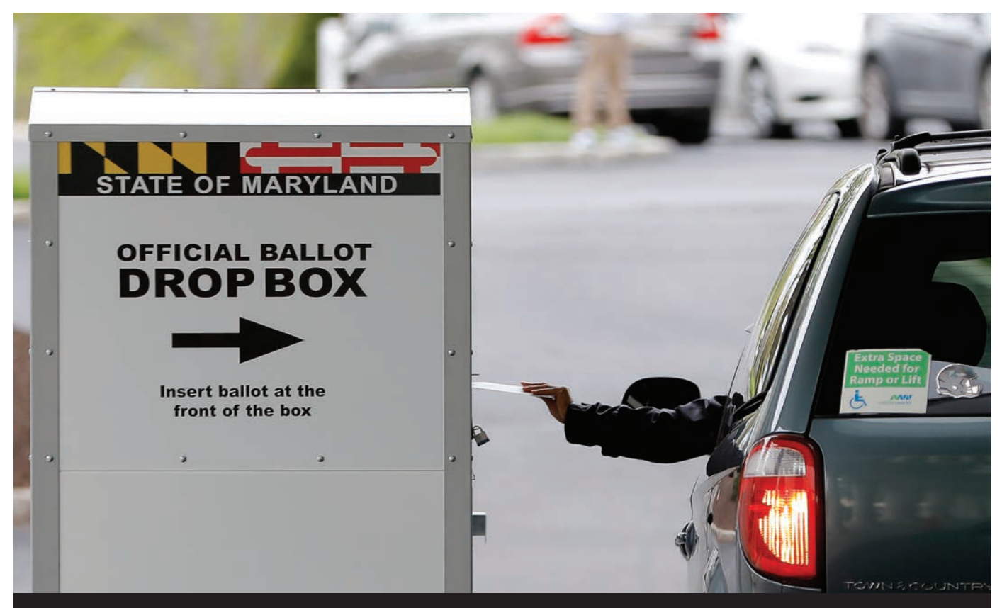
A motorist drops off a mail-in ballot at a voting center in Windsor Mill, Maryland, during a 7th Congressional District special election, April 28, 2020.

Amendments, is undervalued in the United States. In fact, the United States is behind most other developed countries when it comes to voter turnout. For instance in 2016, only 56 percent of the American voting-age population participated in the presidential election.<sup>1</sup> And now additional threats, both from within and without our nation, are poised to erode public confidence in the integrity and value of the voting process itself, further undermining public sup-