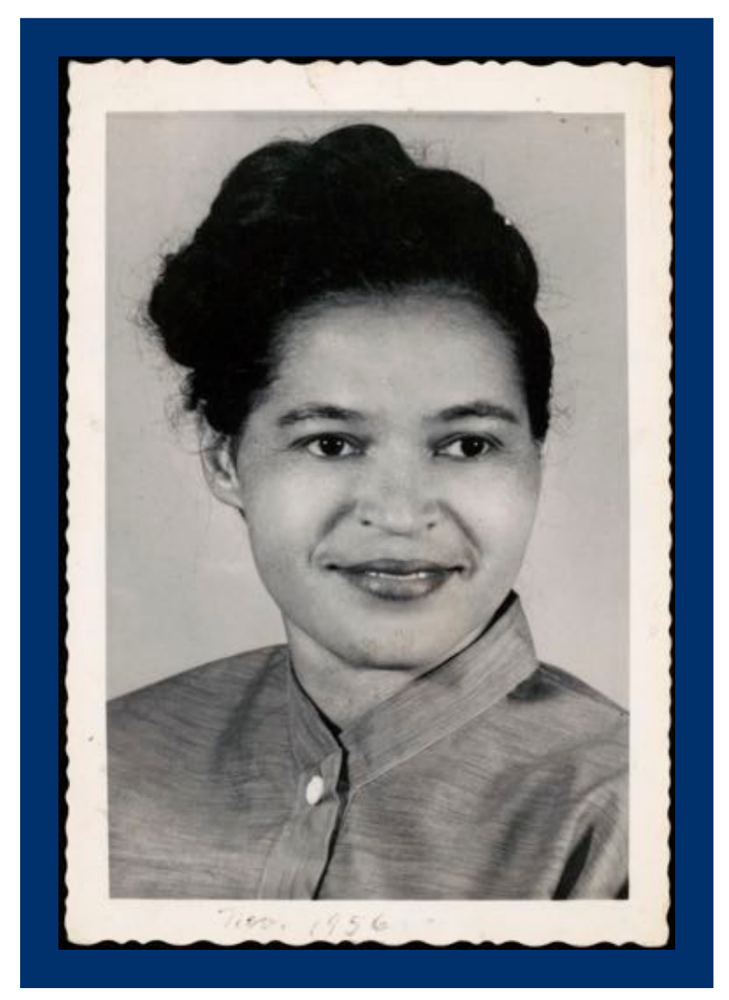
Figure 2. Rosa Parks

Note. Rosa Parks. (1956, November). [Photograph]. Library of Congress. https://www.loc.gov/item/2015645700/