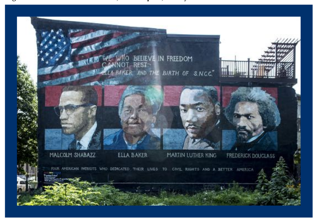
Figure 6. "Freedom School" Mural, Philadelphia, Pennsylvania

Note. Vergara, C. J. (2015). Mural "Freedom School" by Parris Stancell, Philadelphia. Pennsylvania [Photograph]. Library of Congress. https://www.loc.gov/item/2018646583/