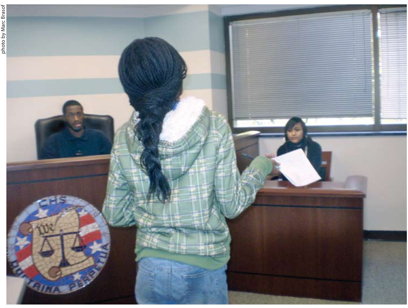
CHS sophomores use the school's courtroom during American Studies to hone judicial argumentation skills.

in high schools today. The day after the election, the administration discovers that the newly elected president was unqualified to run for office. In a typical high school, administrators would remove the student, no questions asked. But at CHS, removing the student without due process—in other words, without the right of the student to appeal—would be unconstitutional. This was the case in our 2007 presidential election.