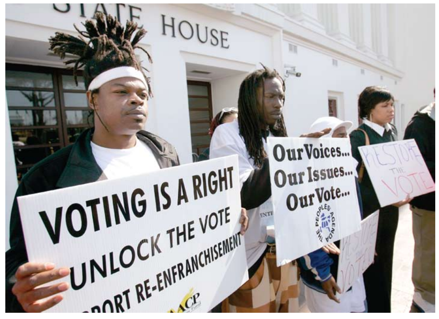
Supporters for a bill that would automatically restore voting rights to convicted felons upon their release from prison hold up signs during a news conference, February 9, 2006, in front of the State House in Montgomery, Alabama.

they reside. In fact, today an estimated 5.3 million Americans have lost their right to vote under these felon disenfranchisement laws.<sup>5</sup>