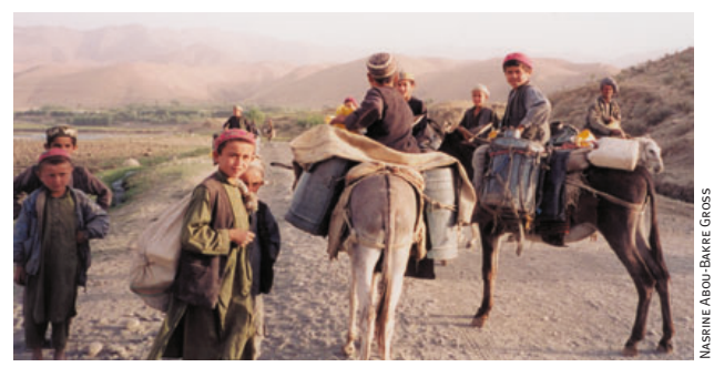
Repatriating Afghan Refugees

SOCIAL EDUCATION 66(1), pp. 25-28 © 2002 National Council for the Social Studies