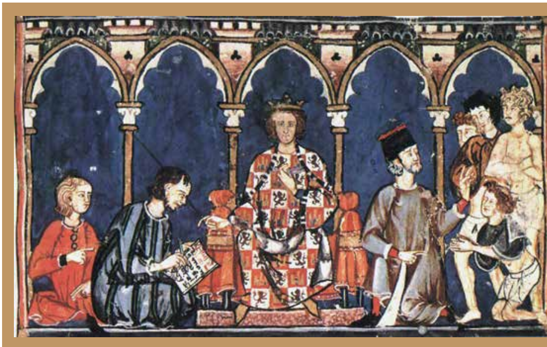
Alfonso X (called the Wise), king of Castile, León and Galicia from 1252–1284, from the Libro de los Juegos

The early colonization of the Hispanic Caribbean was a violent and contentious process in which tensions and conflicts among different ethnic and interest groups were played out. The Spanish crown sought to maintain control by balancing power among different groups to ensure social order, effective government, and economic productivity. Royal orders, like the one included in this article, were aimed at achieving those three goals. This 1527 royal order reflects a legal tradition dating back to the thirteenth-century Siete Partidas (Seven-Part) code.