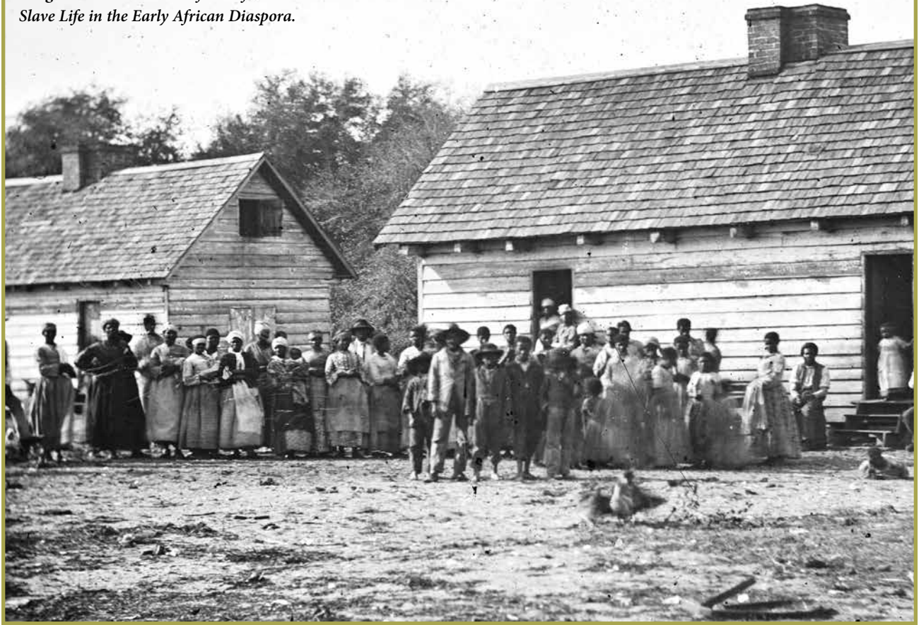
“Plantation Slaves, Beaufort, South Carolina, 1862.” Slavery Images: A Visual Record of the African Slave Trade and Slave Life in the Early African Diaspora.

www.slaveryimages.org/slaveryimages/item/1367