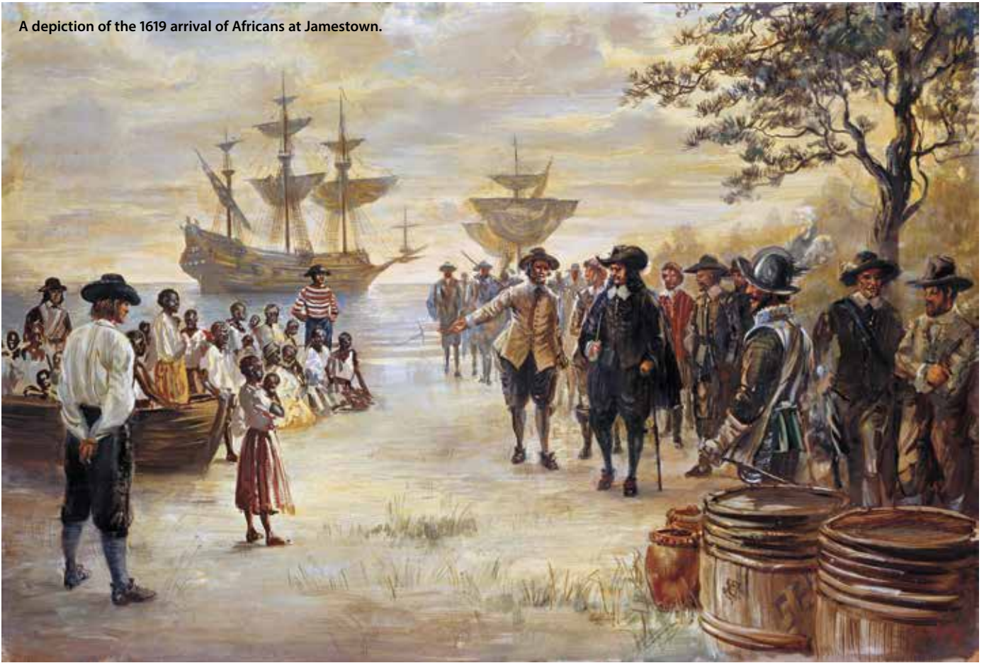
A depiction of the 1619 arrival of Africans at Jamestown.

Democracy and slavery in America were, in essence, born as twins. But their growth and development has not been equally recognized for much of our history. All 13 of the original colonies permitted slavery and most passed laws that cemented racial slavery as a permanent fixture, including the rule that children born of enslaved women were also enslaved—contrary to existing English law.