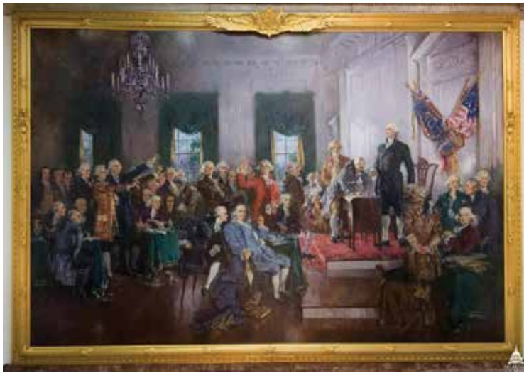
The scene at the signing of the Constitution, oil painting by Howard Chandler Christy, 1940