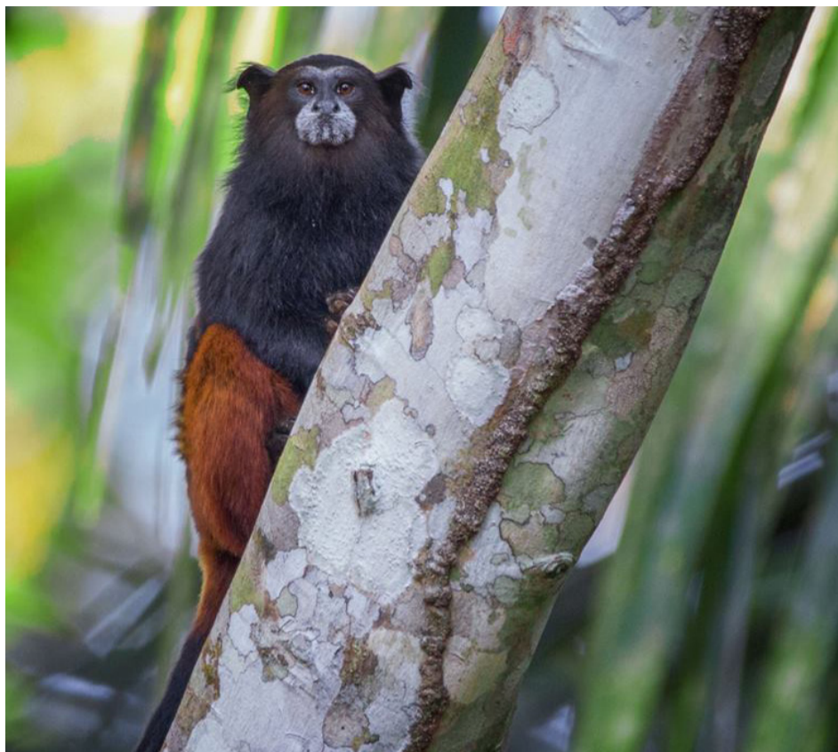
A saddle-back tamarin watches from the trees along the shores of Lake Sandoval, Peru (Photo: Leonard Beck).

Understanding the Inquiry Design Model , 47–49.