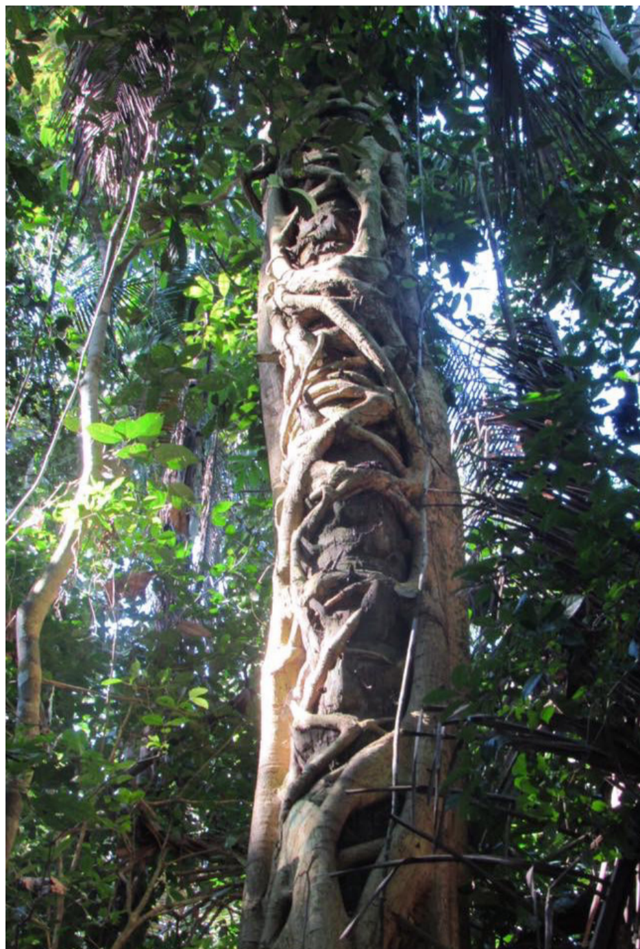
Strangler fig on a host tree in the rainforest of the Peruvian Amazon in the Madre de Dios region.

After communicating their findings, the final step of the inquiry is to propel students into the world of becoming makers of change. Globally competent students do more than gain knowledge and understanding; they seek to make a difference in the present, and wait until they “grow up.” 16 Encourage students to choose an action plan during their research. Actions are most meaningful when driven by student choice, either as a class, groups, or individuals. It may be an action as simple as starting a family pledge to buy more sustainable products; educating the school and community on current issues; or digging deeper